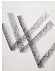
Lidy Prati Untitled , n.d. Facsimile of drawing 8 1/4 × 6 1/4 in. (21 × 15.9 cm)

All works from the collection of the Institute for Studies on Latin American Art (ISLAA)