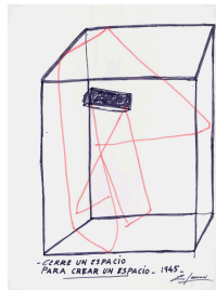
Enio Iommi Sketch for Volumen espacial (1945), 2009 Marker on paper 24 3/4 × 17 3/4 in. (69.9 × 41.1 cm)