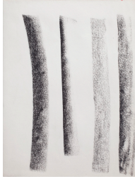
Lidy Prati Untitled , n.d. Facsimile of drawing 8 1/4 × 6 1/4 in. (21 × 15.9 cm)