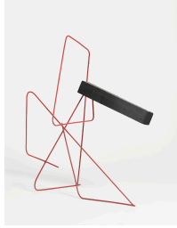
Enio Iommi Volumen espacial (Spatial Volume), 1945 Iron, wood, and synthetic enamel 35 13/16 × 26 1/2 × 30 1/2 in. (90.9 × 67.3 × 77.5 cm)