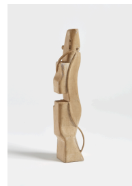
Gyula Kosice Madí , 1954 Wood and plaster 19 5/8 × 3 1/2 × 3 1/2 in. (49.8 × 8.9 × 8.9 cm)