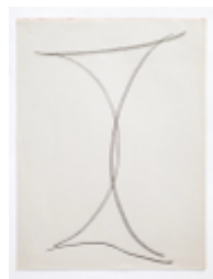
Lidy Prati Untitled , n.d. Facsimile of drawing 8 1/4 × 6 1/4 in. (21 × 15.9 cm)