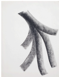
Lidy Prati Untitled , n.d. Facsimile of drawing 8 1/4 × 6 1/4 in. (21 × 15.9 cm)