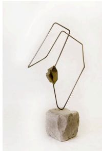
Enio Iommi Volumen espacial (Spatial Volume), 1948 Bronze, steel, and marble 29 1/8 × 13 × 10 in. (73.7 × 33 × 25.4 cm)